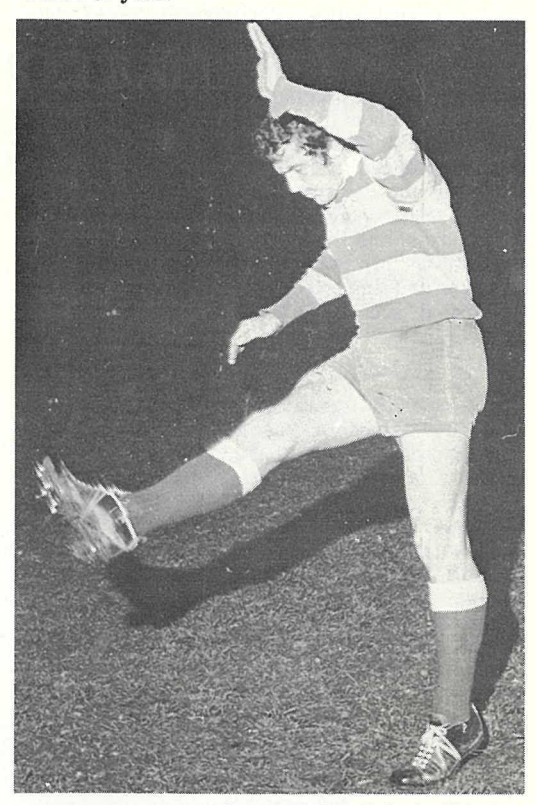
-Sponsored by Talley's Fisheries.