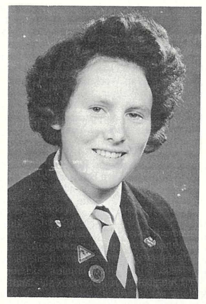
DUX OF SCHOOL, 1972