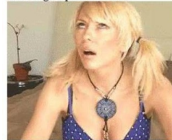
The longest password ever

We laugh -- but her I. D. is safe. During a recent password audit by a company, it was found that an employee was using the following password: "MickeyMinniePlutoHueyLouieDeweyDonaldGoofySacramento" When asked why she had such a long password, she rolled her eyes and said: "Hello! It has to be at least 8 characters and include at least one capital."