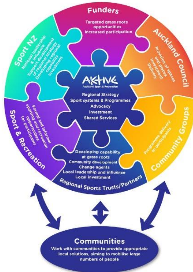
The Auckland Approach to Community Sport

The Auckland Approach to Community Sport brings together a coalition of providers with distinct roles as shown on this diagram.