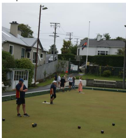
The club flag flying at half mast.