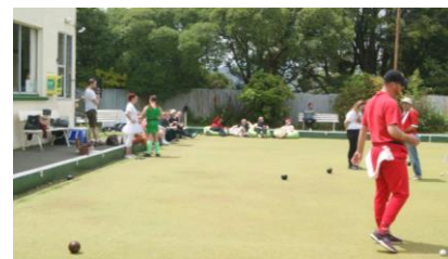
Bean bags on the green! Don't tell the greenkeepers.