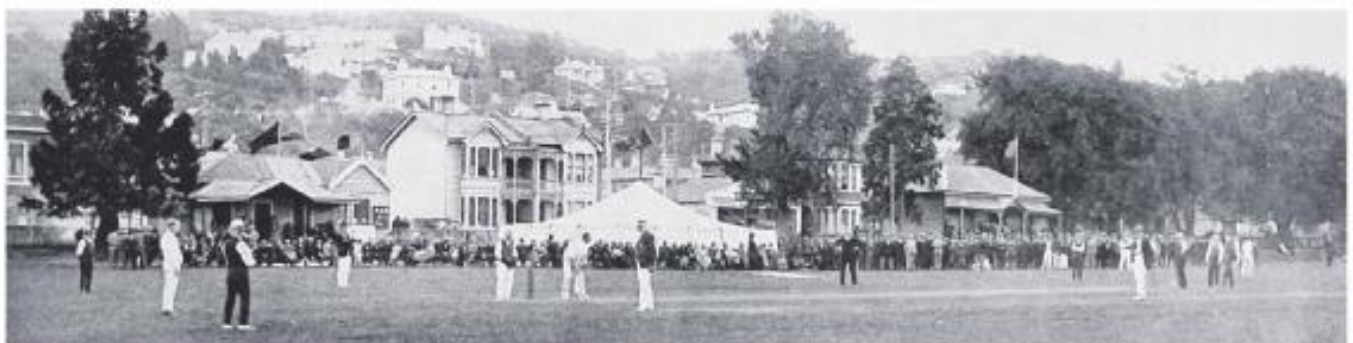
A veterans' match on Dunedin's North Ground to mark the 60th anniversary of Albion Cricket Club.

COPIES OF PICTURE AVAILABLE FROM OOT FRONT OFFICE, LOWER STUART ST, OR WWW.OOTSHOP.CO.NZ