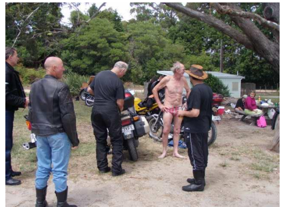
Jan 2010: Picnic at Paton's Rock