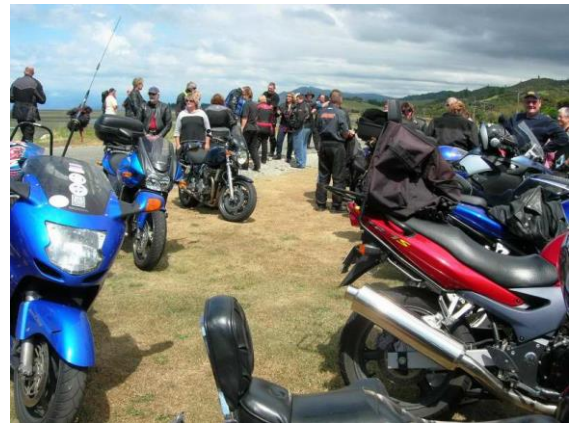
Feb 2007: Filco Sponsored ride to Farewell Spit

Ulysses Nelson Branch – images from the past.