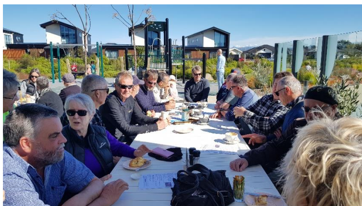
Alioke Sat Sep 2

Sunday Oct 29 th Reefton. Meet riders returning from Hokitika overnighter.