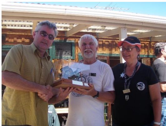
Feb 2010: Mystery Ride