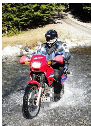
Feb 2010 Dusty Riders