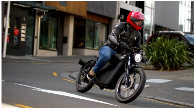
Test drive

FTN Motion is a startup company in Te Aro Wellington NZ, opening in 2015 and making electric mopeds.