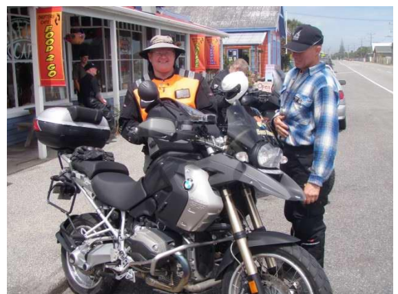
Jan 2010: En route to Karamea Overnighter