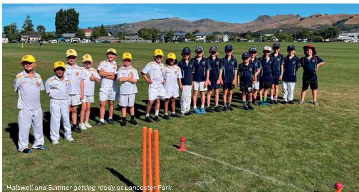
Halswell and Sumner getting ready at Lancaster Park.