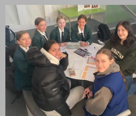
Growth Mindset Sessions