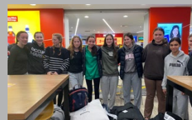
SOC Spirit of Adventure Contingent in Auckland

Pippa H, Special Character Captain, Chapel 14th June