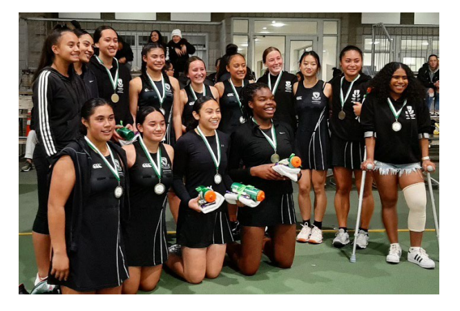
WASSC Prem 1 Winners: Avondale College