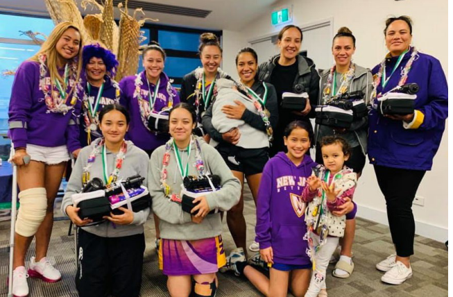
Premier Winners: Baytex Panthers