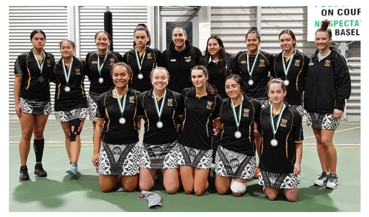
WASSC Prem 1 Runners-Up: Massey High School