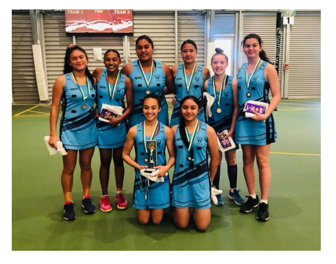
WASSC Year 9 Winners: Waitakere College