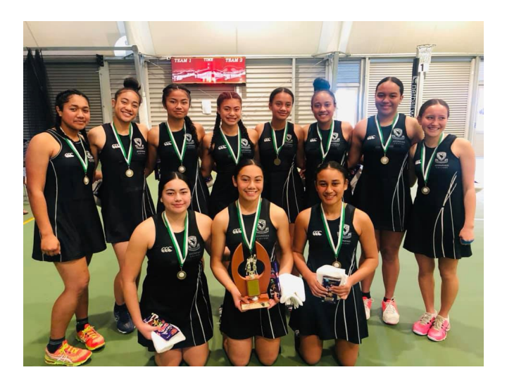
WASSC Year 10 Winners: Avondale College