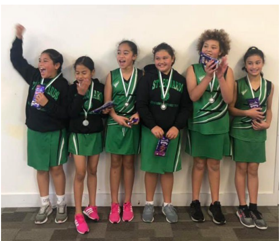
The two St Leonard's Y5 teams that played off in the final